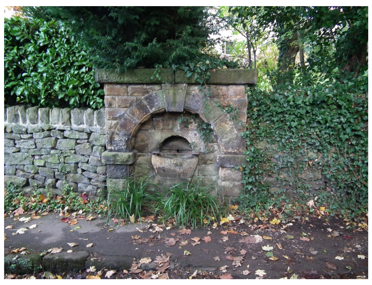
List of Assets Asset Number 1, Fountain, Spa Lane Location Ordnance Survey SE 113 401